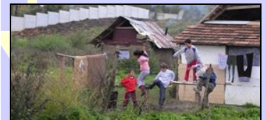
4-Open race segregation.

Gypsy women have been subject to sterilisation, without their consent or knowledge. The city council of Ostrovany recently built a wall around buildings that are inhabited by gypsies. Gypsies in Slovakia are subject to open and undisguised discrimination. The Slovakian government incites people against gypsies. Jan Slota the secretary of the leading Slovakian government party made the following public statement: