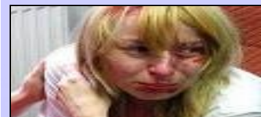
6-Victims of hate crimes.

The Slovakian justice and police are not independent and do not guard its independence. Victims of hate crimes are, if they are courageous enough to report a hate crime to the police, often humiliated and not taken seriously. Slovakian police openly humiliates “Untermenschen”. The Slovakian police is not a representation of the Slovakian autonomous population.