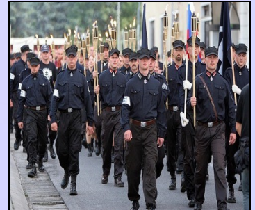
9- The Slovakian "Hitler Jugend" "marches and intimidates openly.

Due to the fact that the Slovakian government does not dissociate oneself from these statements, the Slovakian governmental is morally responsible for these hate crimes. These kinds of public statements are without a precedent in the European Union.