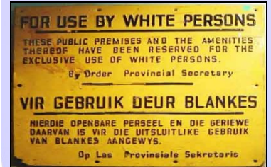
2-Now in the European Union as well.

Slovakia is the only country in the European Union that adopted legislation in 2007, which makes it possible to give people a juridical status of being inferior on the sole bases of their race. Nazi-Germany as well as the apartheid regime in South-Africa had similar laws. Slovakia introduced the concept of collective guilt in the European Union. Consequently Slovakia is the only country in the European Union where a Judge is able to make a verdict on the sole basis of race. (E.g. Person A has been murdered a Slovakian Judge can Judge that the perpetrator B is not subject to sentencing, because person A belongs to an inferior race.)