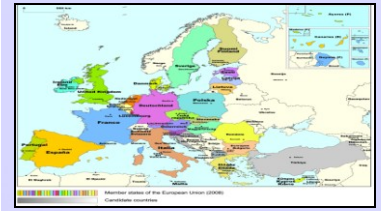
1-Europe after the enlargement.

The European Union enlarged with ten new member states in 2004, the reason for this enlargement was peace and stability on the European continent. The new member state Slovakia signed several treaties on economic affairs and human rights. These treaties were respected till the enlargement and right after the enlargement. At this moment they are not respected anymore.