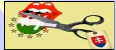
3-Medieval language laws.

Slovakia adopted a very controversial language law in 2009. This language law makes it illegal to use any language apart from Slovakian. According to this law an English language sign or advertisement in public is forbidden. It is evident that the sole purpose of this law is to create a legal ground for ethnic prosecution. Obviously the Slovakian authorities will only use this law to prosecute the autonomous Hungarian speaking population of Slovakia.